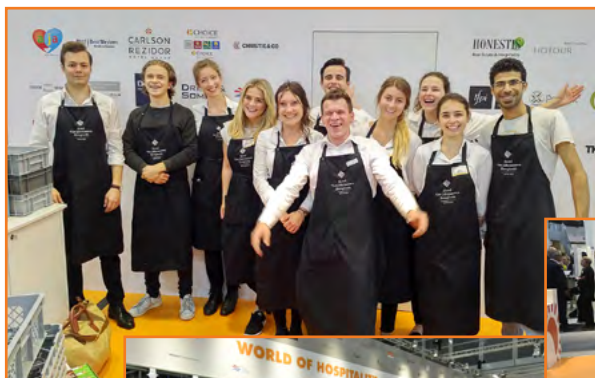
The exhibitors again gave top marks to the hosts and hostesses.

The supply of drinks, coffee and tea specialities as well as finger food is included in the packages for stand partners and their guests.